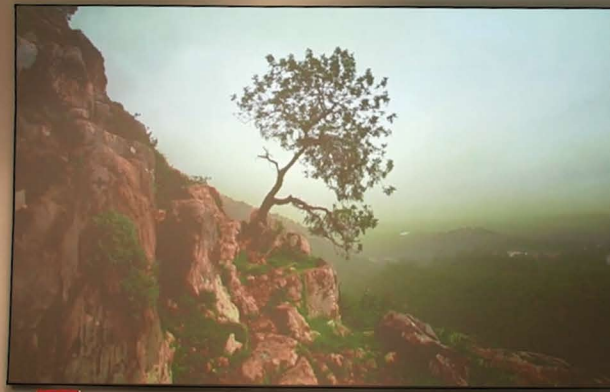
Model# WB90X-CLR2 Undoctored image of actual projector presentation