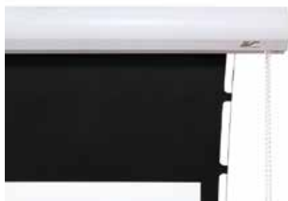
Top Corner Case Detail

Elite ProAV™ presents the Manual Tab-Tension Series , as its premium grade non-electric tab-tensioned projector screen. The design features a manually operated bead chain clutch mechanism with a swift rolling sprocket that allows the material to stop at any point of its drop/rise operation. The tab-tension system allows the projection surface to be flat and taut so that ultra/short throw projectors may be used with this screen as well.